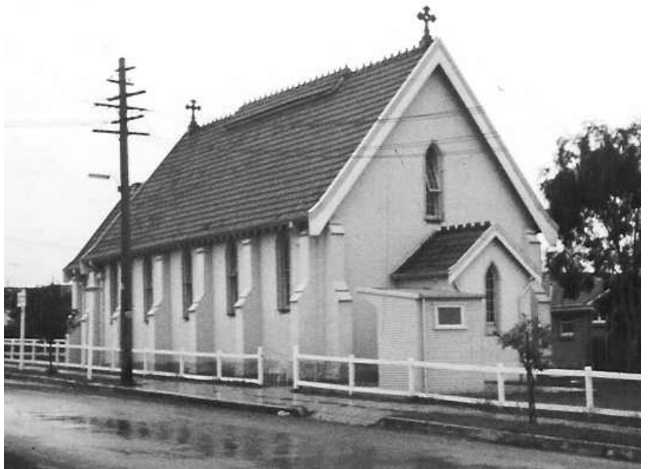
Figure 1 Historic St Ann's Church 1964.

Historic St Ann's Church was built between 1859 and 1864 within the Village of St Anne's. The Village was laid out by Father John Joseph Therry and the streets of the Village were named for prominent Catholic ecclesiastics of the time.