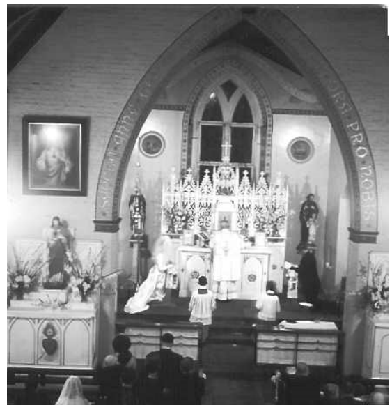
Figure 2 Historic St Ann's altar 1964.