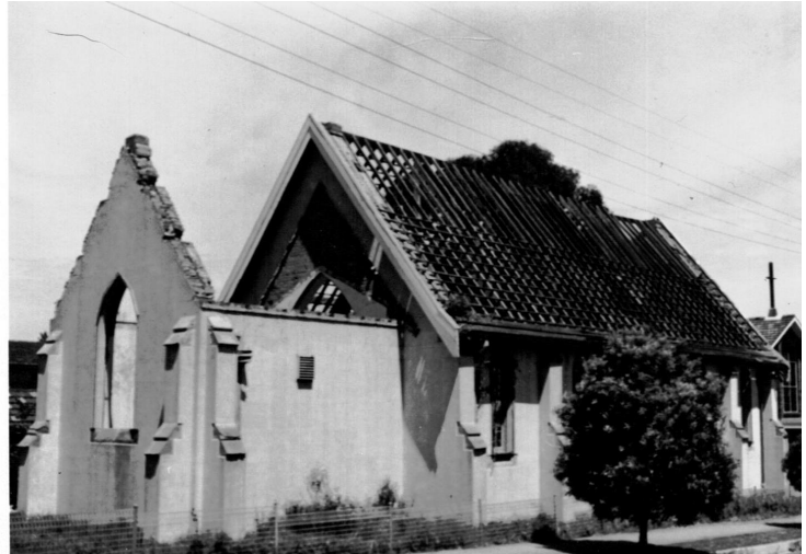
Figure 7 Historic St Ann's 1986 pre-rennovation

The Friends of St Ann's was formed in 1983 from members of the local community concerned by the deterioration and looming threat of demolition of the historic church. The Friends 29 considered the key factors of importance supporting the restoration of historic St Ann's included: