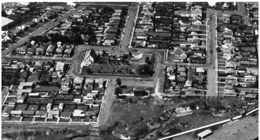
Figure 4 St Anne's Village 1947