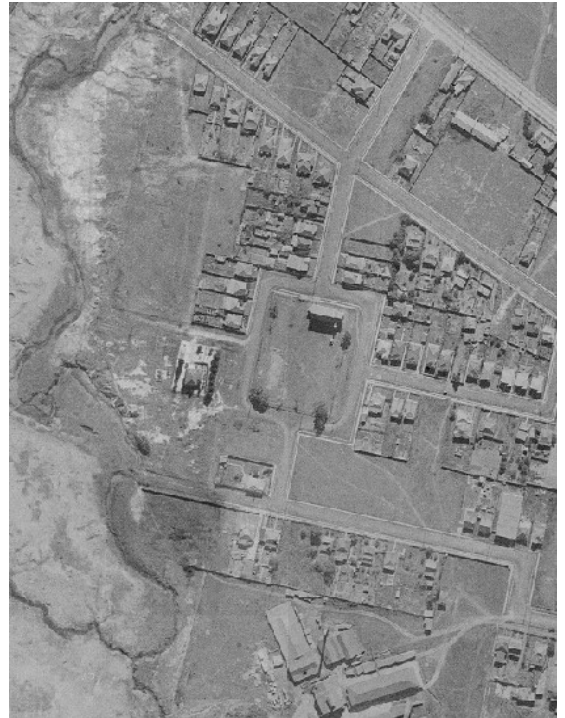
Figure 6 St Anne's Village. 1943 Aerial.