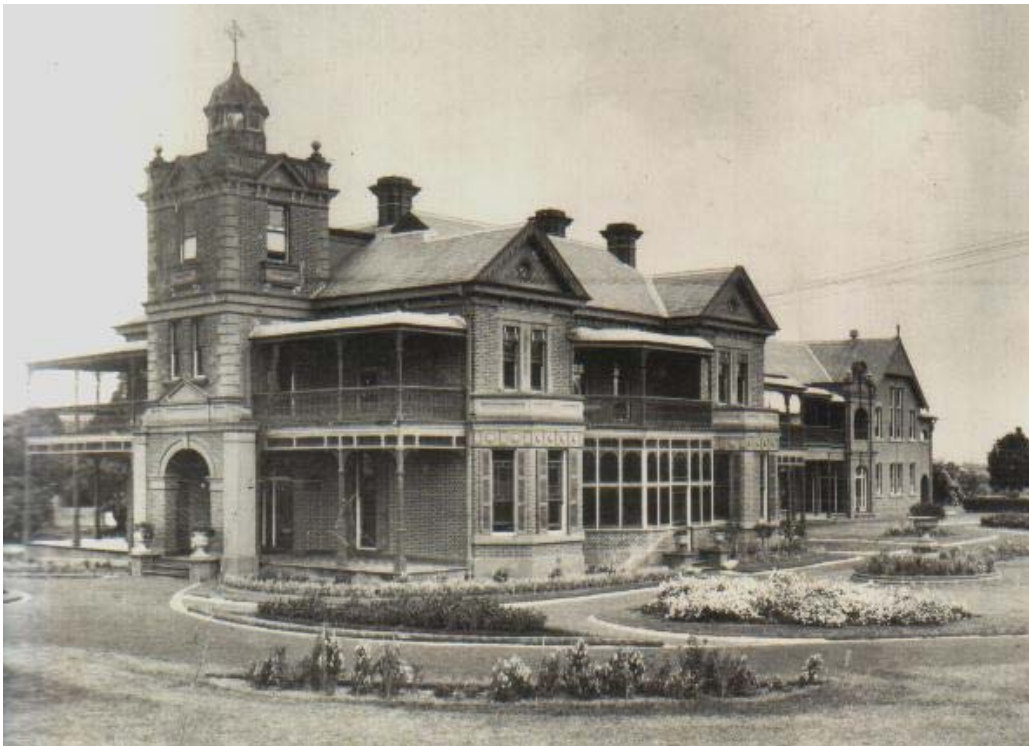
'Mount Royal' Strathfield

W. G. McMinn, 'Reid, Sir George Houstoun (1845-1918)', Australian Dictionary of Biography, National Centre of Biography, Australian National University, http://adb.anu.edu.au/biography/reid-sir-george-houstoun-8173/text14289 , published first in hardcopy 1988, accessed online 22 January 2019. 'Reid Sells his Pup and Party', 1904, September 4, The Truth (Sydney, NSW: 1894 - 1954) , p. 7. Retrieved January 7, 2019, from http://nla.gov.au/nla.news-article167904637